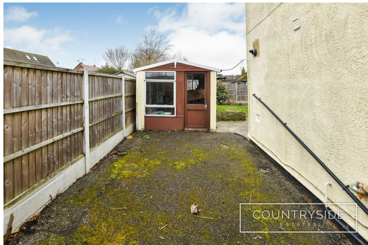
Single detached garage with glazed windows and pedestrian door to front.