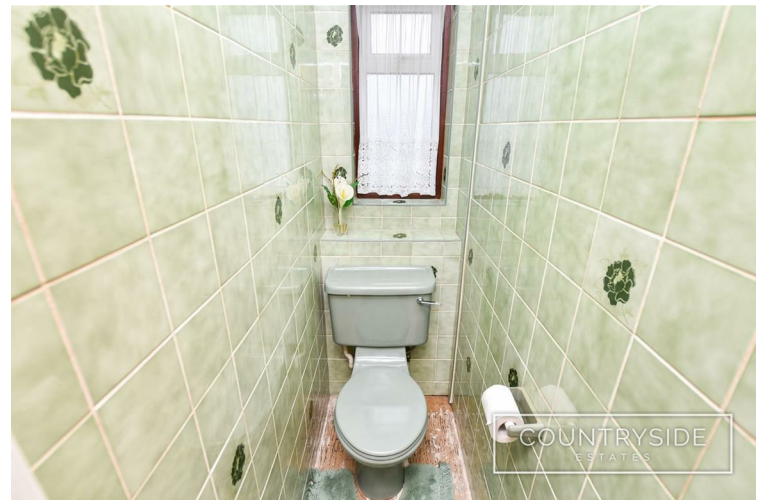
Aluminium double glazed obscure window to rear aspect, artex ceiling, fully tiled walls, close coupled W.C.