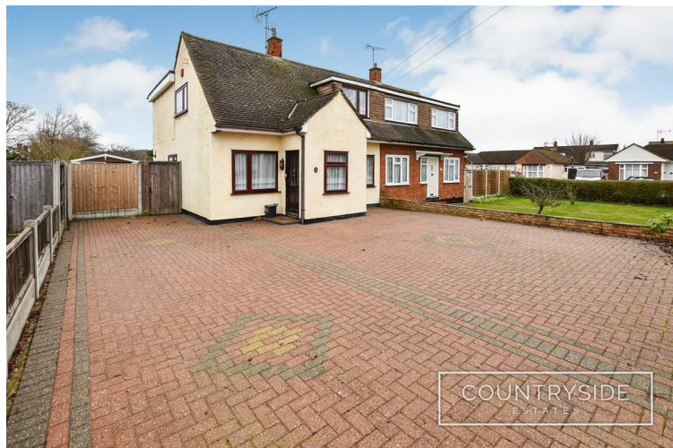
Low maintenance block paved driveway, providing ample off street parking for several vehicles.