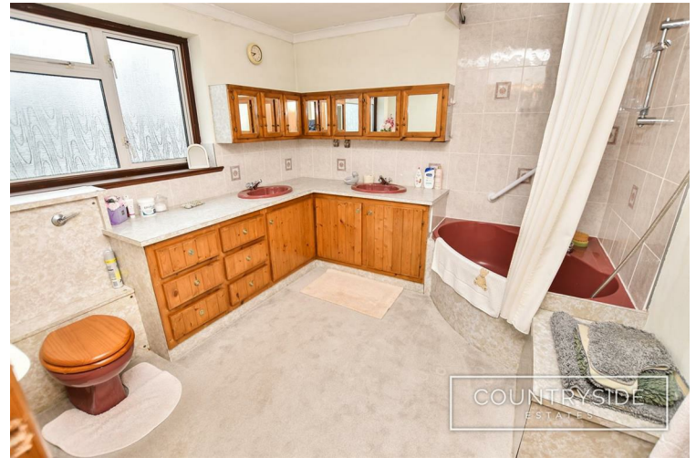
Aluminium double glazed obscure window to rear aspect, coved artex ceiling, carpet, half tiled walls, built in vanity unit with inset twin sinks, corner bath with shower over, concealed cistern W.C, radiator.