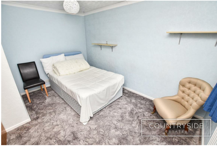
Bedroom Three 12'11 x 8'8 (3.94m x 2.64m)