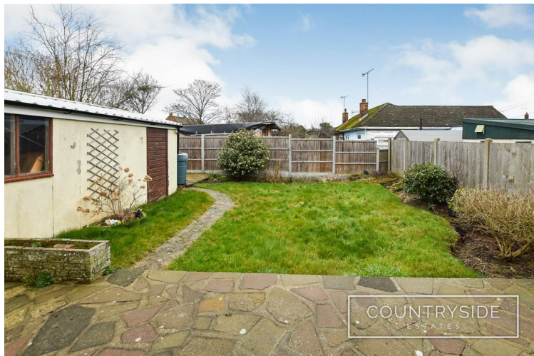
Council Tax BAND D Castle Point Borough Council