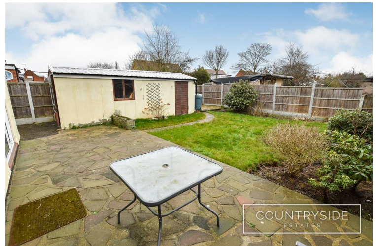
Commencing with paved patio leading to lawned area with flower bed borders, 11ft wide side access.