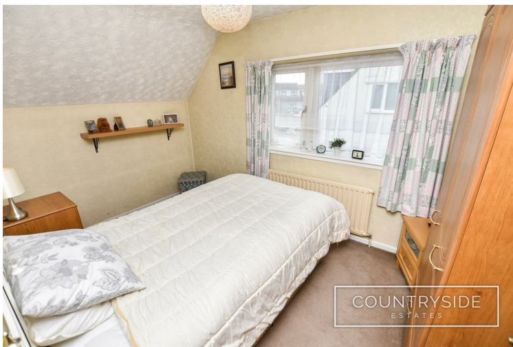
Upvc double glazed window to side aspect, artex ceiling, carpet, built-in storage cupboard, radiator and power points.